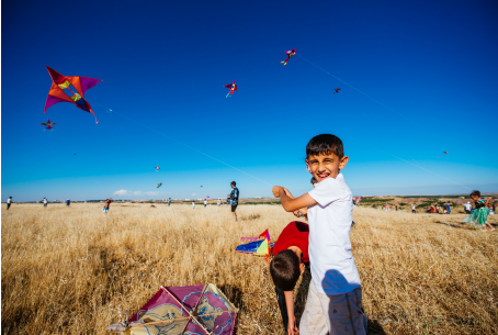
Colourful Hopes Association