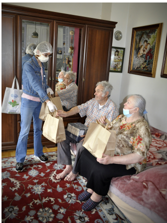
Nasa Kuca (Our House)