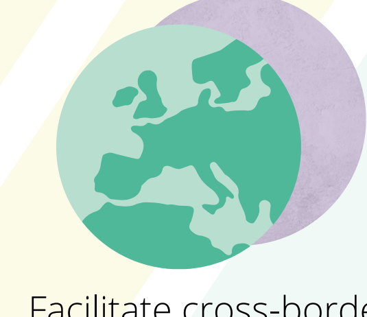
Facilitate cross-border philanthropy