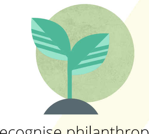
Recognise philanthropy and engage with it