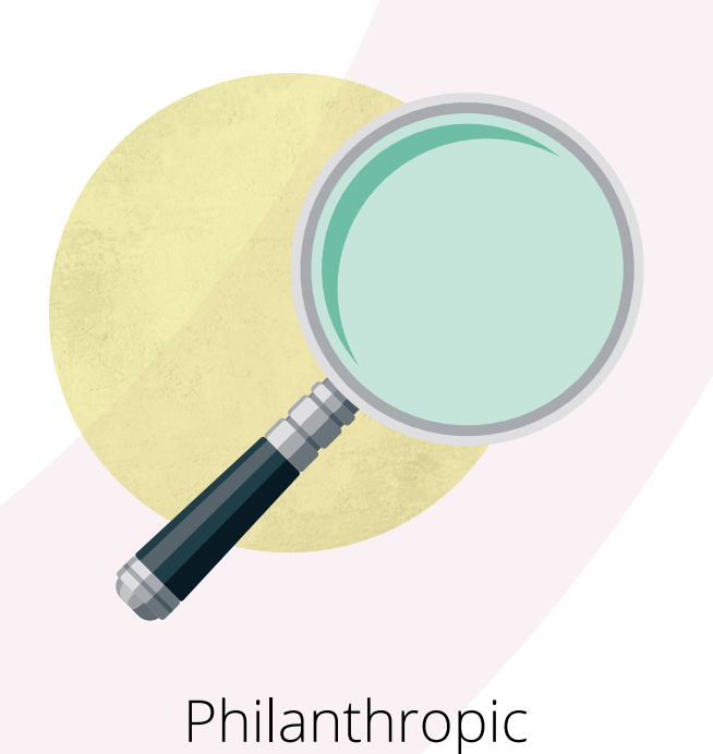
organisations need to be mutually recognised