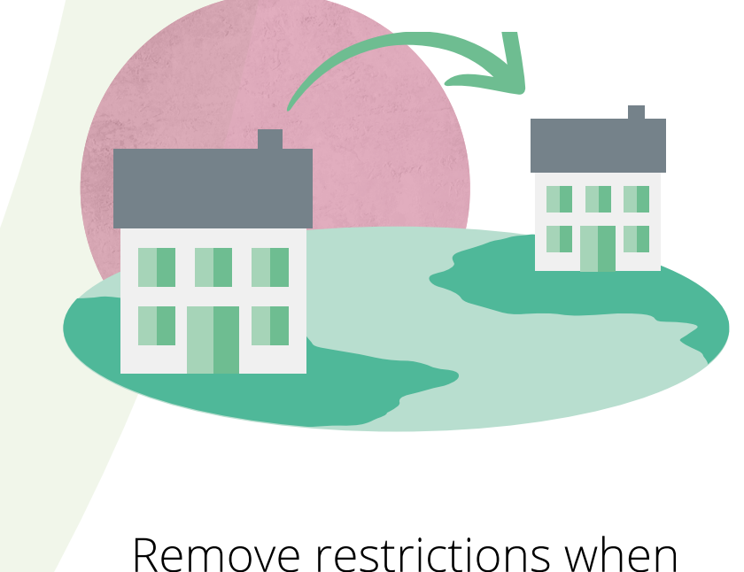
moving HQs and performing cross-border mergers within the EU